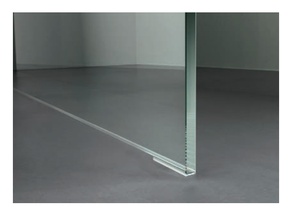
The ZERO Walk In BASIC is always laid on the floor without a floor profile using a transparent edge protection. Here silicone is used for sealing along the glass edge.

The ZERO Walk In BASIC is equipped with a 30mm wall profile. This makes it possible to compensate for slight inclines of the wall or floor and means that glass walls in standard sizes can be used. The wall profile can be completely or partially sunk into the wall; on the floor it is always installed without a profile.