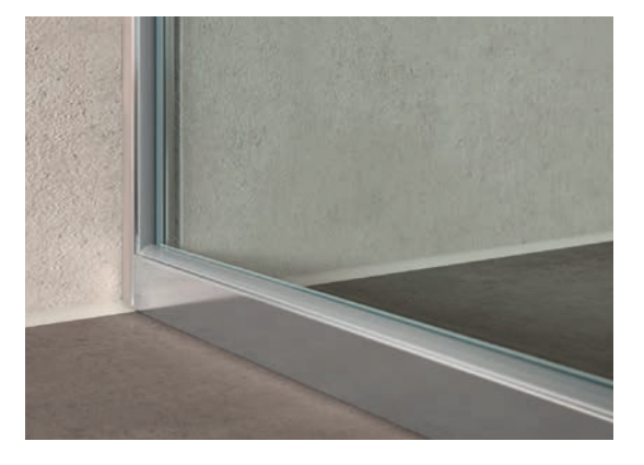
Can be freely combined: As an example, the floor profile is mounted ON the tiles, the wall profile is integrated IN the wall.