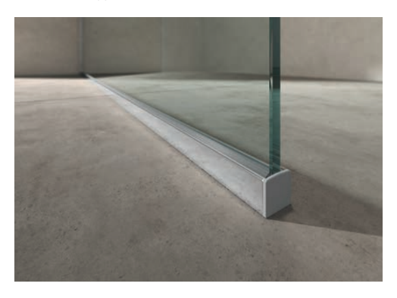
Beautiful appearance for many years: high-quality discreet seals instead of silicone joints.