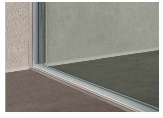
100% transparent: the profiles are integrated IN the wall and floor.

The new shower series Artweger ZERO, impresses with its complete transparency. Its connecting profiles can be integrated into the wall and floor. Only the glass remains visible nothing else. Whether in a newly built or renovated bathroom, the Artweger ZERO can be individually adapted to suit your needs and is also a visual highlight.