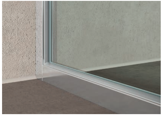
100% silicone-free: The just 17 mm high profiles are mounted ON the surface, (tiles and shower tray)