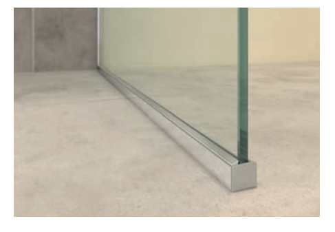
The glass wall is installed in the floor profile on the existing floor or alternatively mounted without a floor profile using a transparent edge protection. This variant is sealed with silicone.

ZERO Walk In VARIO - the Walk in for small bathrooms The Artweger ZERO Walk In VARIO combines a fixed glass part with a 360 ° movable glass part that can be swiveled 180 ° inwards and 180 ° outwards. This enables free access to the open shower area even in tight spaces.